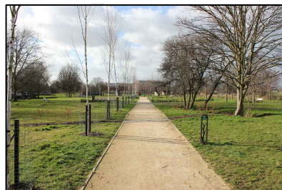
Existing Public Right of Way Re-Aligned To Suit Proposals With Rolling Gravel Finish