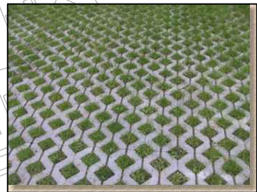
Shared Pedestrian/Cycle way (+ Emergency Access route) with Grasscrete finish